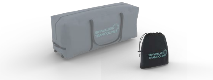
Storage bag for soft goods and cinch bag for springs

Our signature series not only features an extended warranty but also incorporates numerous meticulous details that set it apart.