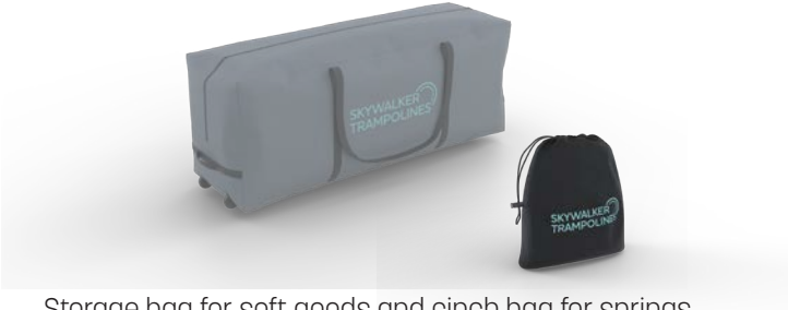
Storage bag for soft goods and cinch bag for springs

Our signature series not only features an extended warranty but also incorporates numerous meticulous details that set it apart.