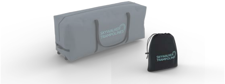
Storage bag for soft goods and cinch bag for springs

Our signature series not only features an extended warranty but also incorporates numerous meticulous details that set it apart.